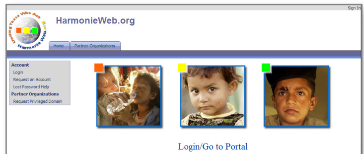
Figure 1 - HARMONIEWeb Public Web Site

SharePoint also serves as the foundation of the HARMONIEWeb private portal. MicroLink built out the private portal leveraging SharePoint's rich "out of the box" collaboration features but also added key custom web parts to meet requirements not covered by SharePoint. In addition to offering standard features like discussion boards, blogs, and wiki MicroLink worked with USJFCOM to develop an event site template that offers features that a disaster relief team would need to collaborate more effectively during a disaster. These features include both standard SharePoint web parts like the calendar, document libraries, and announcements but also custom built web parts by MicroLink that integrate LCS and Adobe Connect.